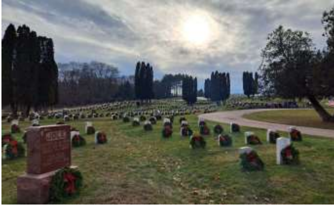
Above: A stunning view of the cemetery through a cloudy sky.